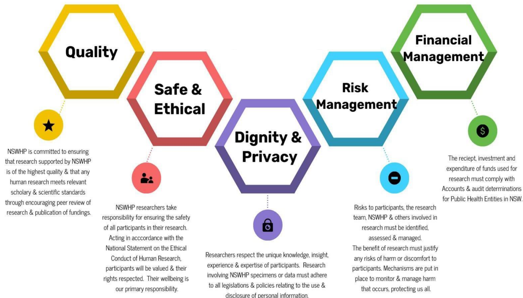
Figure 2. NSWHP's Research Governance Core Principles (excerpt taken from NSWHP Research Governance Framework )